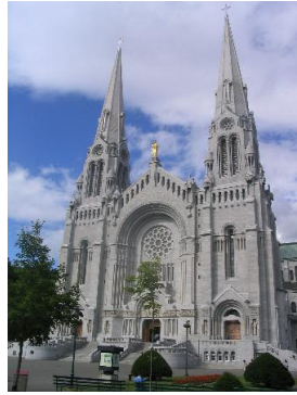
Shrine of St. Anne de Beaupre’

be shown the annals of devotion to St. Anne down through the centuries, and participate in the Stations of the Cross before an enjoyable dinner. In the evening, you will join in the Rosary and take part in the Candlelight Procession. Dinner and overnight stay at the Basilica Inn.