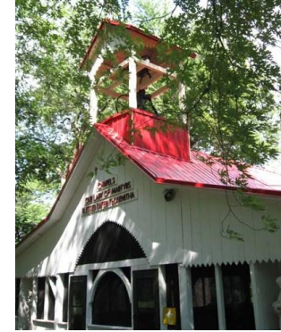
Martyrs and Kateri Chapel

After breakfast in the hotel, you’ll depart for Auriesville, NY, birthplace of Kateri Tekakwitha, stopping for a luncheon on the way. Mass will be celebrated at The National Shrine of the North American Martyrs, also known as the Shrine of Our Lady of Martyrs. This was dedicated to the Jesuit missionaries who were martyred at the Mohawk Indian village of Ossernenon between 1642 and 1646. In the late evening you will continue on the short ride to Albany for dinner and overnight.