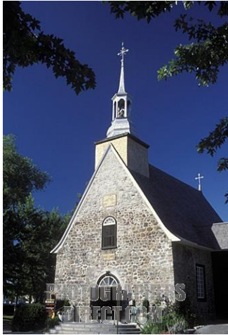
Shrine of Notre-Dame-du-Cap

Moving on to the shores of the St. Lawrence River, you will find Cap de la Madeleine, a place of peace and tranquility, serenity and beauty and a history going back to 1634. Jesuit Missionaries served the settlers of the new village here, building a little timber chapel in 1659. Five years later it would become the first of Canada’s Catholic churches to be dedicated as a Confraternity of the Holy Rosary. Overnight stay in Mason de la Madone (or similar).