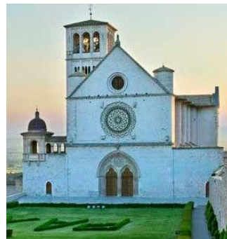
Basilica of St. Francis of Assisi

After breakfast in your hotel, you will depart for ASSISI, birthplace of St. Francis where Mass will be celebrated in the Basilica by the tomb of the beloved Saint. This basilica was nearly destroyed when its roof collapsed during the horrendous earthquake of 1997. You will be shown magnificent frescos which have now been almost completely restored. Enjoy a walking tour of a mystical city atop the green slopes of Mout Subasio and surrounded by ancient walls. Lunch in a typical restaurant before a visit of the church of St. Mary of the Angels. Continue on to ROME. Dinner and overnight stay in your hotel.